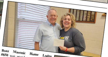
Boaz Masonic Home Lodge #850 was proud to present $1000 each to the scholarship fund of the Kentucky DeMolay and Kentucky Rainbow Girls again this year. We would like to challenge other lodges in Kentucky to contribute to their youth groups in any way they can to help our possibly future members.